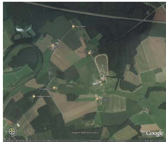
Google Earth is an excellent tool