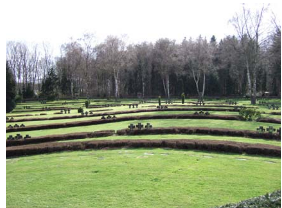
The Sandberg is now a German military cemetery