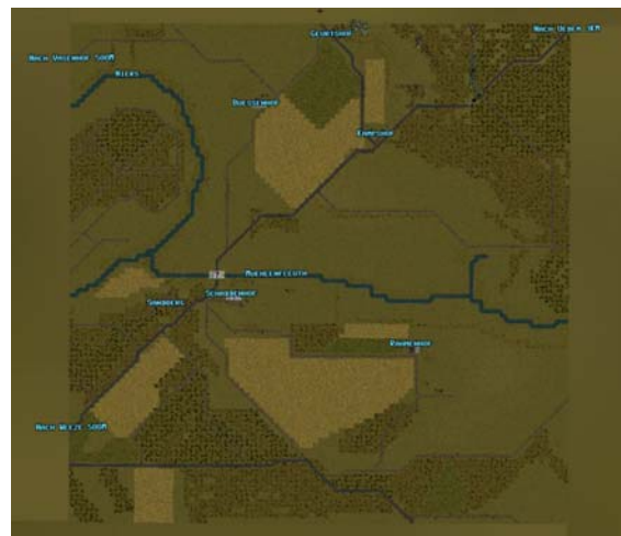
The CMAK map