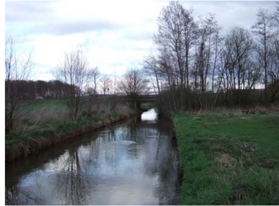
The bridge over the Mühlenfleuth