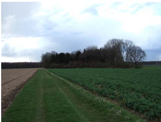
The patch of woods between Rahmenhof and Scahddehof